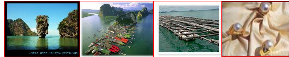
James Bond Island Panyi Floating Village Rang Yai Island Pearl Farm

En route to James Bond Island we stop at Rang Yai Island to visit a Pearl Factory. From there we will enjoy the fabulous scenery of Phang-nga bay. After a stop at James Bond Island (Where "Gold Finger" was filmed) we will spend approximately 2 hours at Panyi Floating Village, having a fresh seafood lunch, sightseeing, and shopping. On the way back to The Racha, we will visit Khai Nai Island for snorkeling.