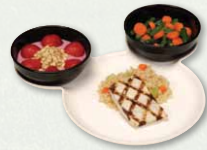
Grilled Fish of the Day

served with Whole-Grain Pilaf, Veggies, and Yogurt Parfait